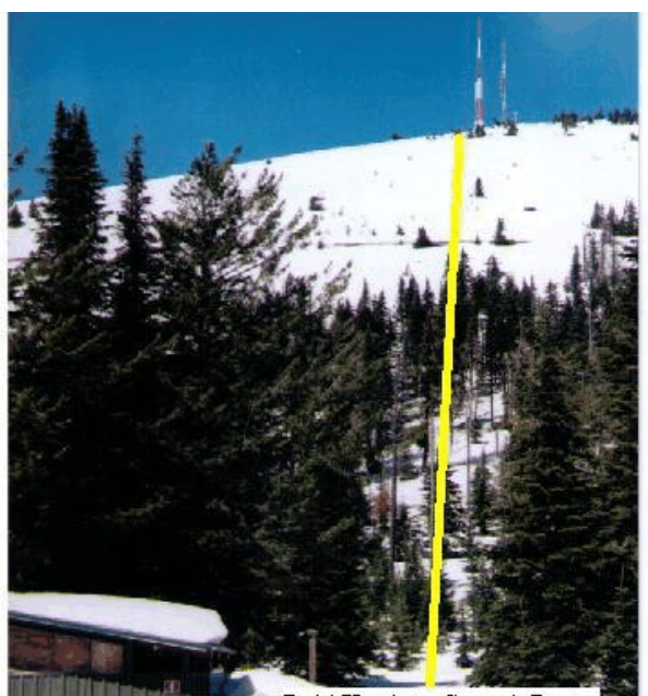
Bald Knob to Summit Route

The first product created from the GIS project was an area map highlighting the snowshoe trails. The map was included as part of a new Friends Group brochure for this rapidly increasing user group. Now, instead of trying to get trail information from the rangers, web-footed hikers can simply pick up a brochure at the trail heads. The brochure describes five trails, plus the route to the summit that was worked out between the alpine ski concessionaire and the Advisory Committee as part of the draft trail plan. Snowshoers and backcountry skiers are now permitted to take a direct line