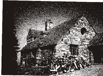
The new look!

cedar shakes, repair the failing masonry, install copper flashing, replace broken windows, re-paint the trim, and repair the door. The interior of this 1934, CCC constructed stone structure was also spruced up by the alpine ski area concessionaire for weekend use, complete with knotty pine furniture