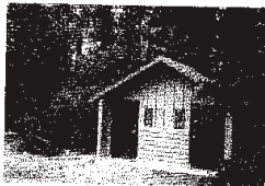
A big relief!